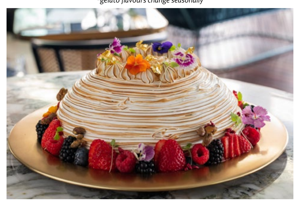
Steamed Vanilla Cheesecake with berries, graham crumble, honeycomb 10-14 guests - $98

soft meringue, chef's selection of sorbets, fresh fruit & nuts (v) (subject to change seasonally) 10-16 guests - $98 20-25 guests - $148 *gelato flavours change seasonally